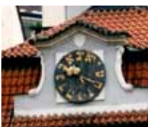
Photo of the Old Jewish Town Hall clocks in Prague. The clock with Hebrew letters signifies the Jewish time, while the clock above it has Roman numerals and signifies the general time – of which the Jewish time is a part.