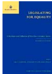
Publication of Legislating for Equality Volume I: The Americas is planned for early 2013.

The Center has recently completed the first volume of the publication Legislating for Equality – a Multinational Collection of Non-Discrimination Norms. Volume I: Europe , published in July 2012 in the Netherlands by Brill Publishing House, under the imprint of Martinus Nijhoff Publishers. The publication was endorsed by UNESCO, and the Director General, Ms. Irina Bokova , provided a foreword.