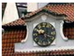
Photo of the Old Jewish Town Hall clocks in Prague. The clock with Hebrew letters signifies the Jewish time, while the clock above it has Roman numerals and signifies the general time – of which the Jewish time is a part.