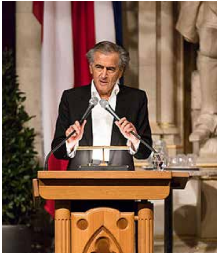
Bernard Henry Levi