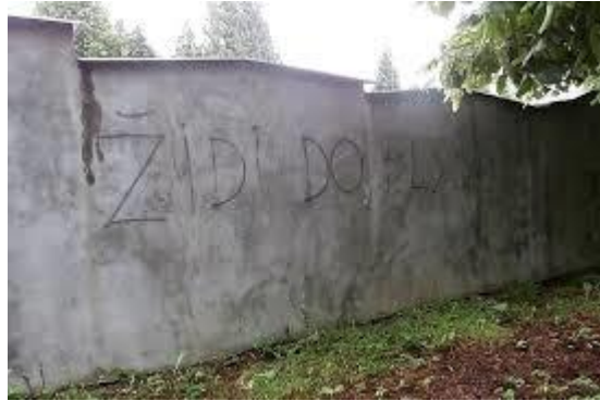
COMPARISON OF VARIOUS ANTI-SEMITISM MANIFESTATIONS FROM 2008 TO 2014